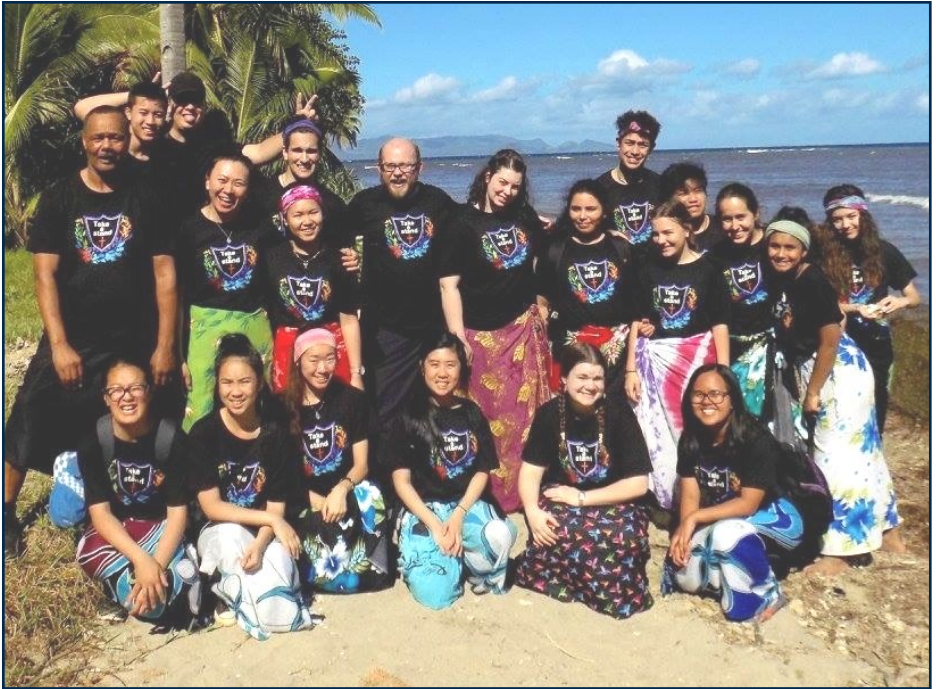
Fiji Missions Trip