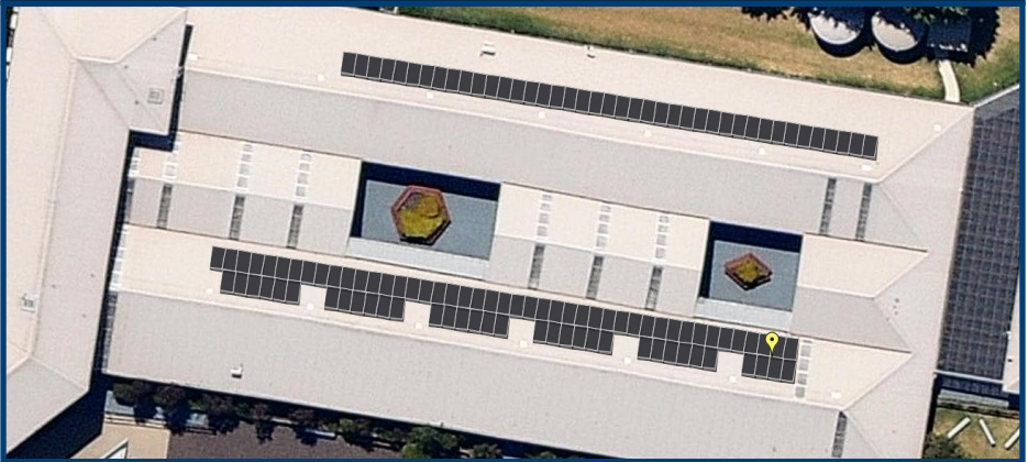
100kw of Solar Panels on School Buildings